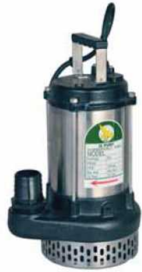
JST 8 2"