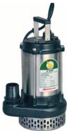
JST 8 2"