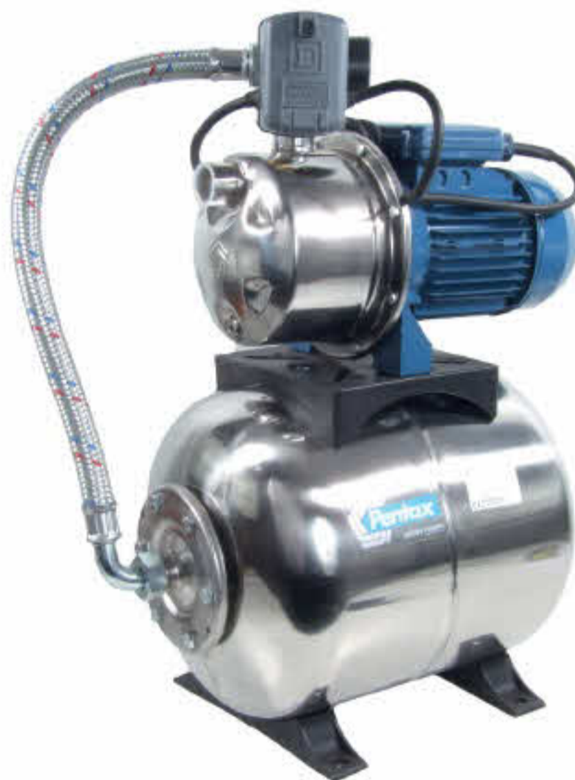
INOX 80 AUTO