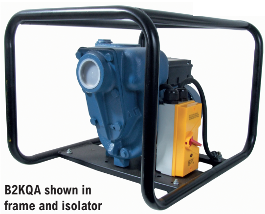
B2KQA shown in frame and isolator