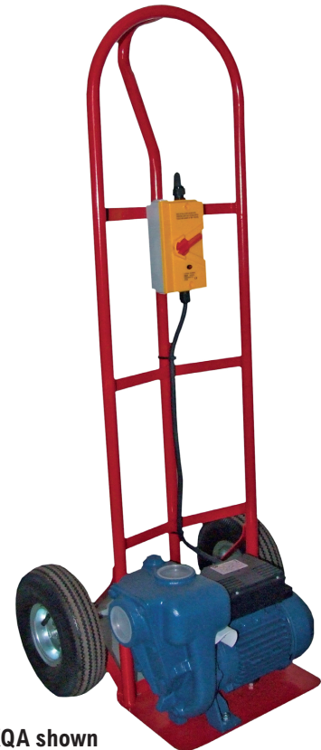
B2KQA shown on sack trolley with isolator