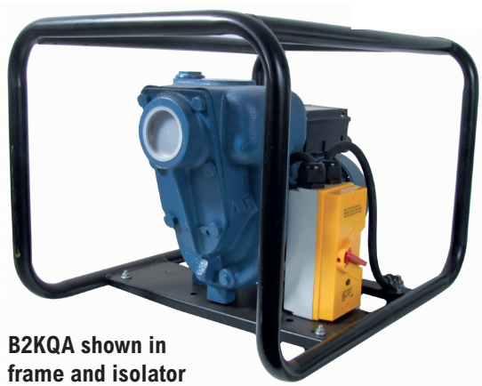
B2KQA shown in frame and isolator