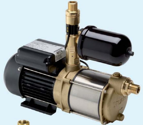
U3.6 bar Single