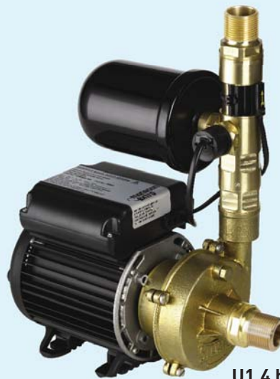
U1.4 bar Single